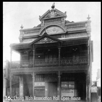
16. Chung Wah Association Hall Open House