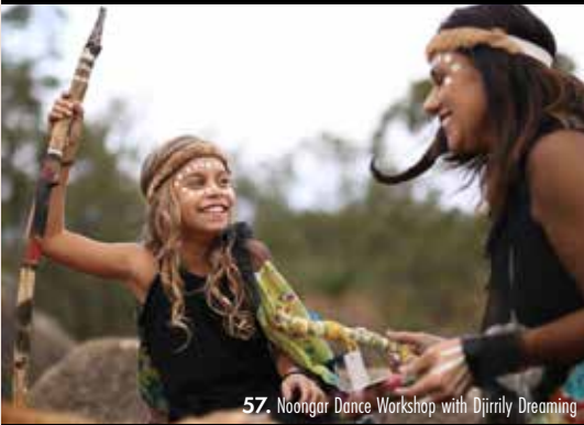
57. Noongar Dance Workshop with Djirrily Dreaming

It doesn't end there! Turn over to see the full listing of events and their locations. With plenty of free events, activities and tours, there will be something for everyone to enjoy.