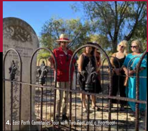
4. East Perth Cemeteries Tour with Two Feet and a Heartbeat

Get ready to see some returning favourites with a celebration of song, dance and language at Nyumbi and tours with Two Feet and a Heartbeat . Expect some newcomers with the WA Women's Hall of Fame , the Perth City Farm Tour and Closeted Stories of Long Ago .