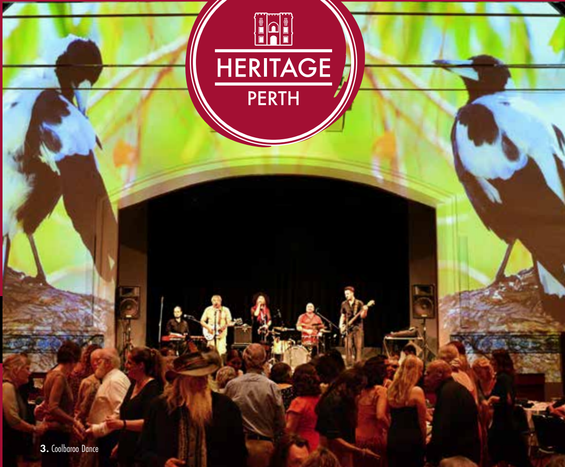
3. Coolbaroo Dance