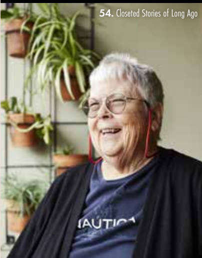
54. Closeted Stories of Long Ago