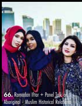
66. Ramadan Iftar + Panel Talk on Aboriginal - Muslim Historical Relations