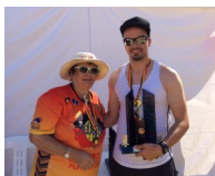
TROPHIES TO WIN!