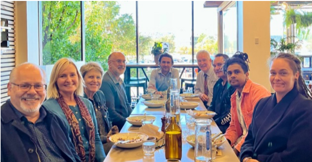
Some of our Advisory Board members