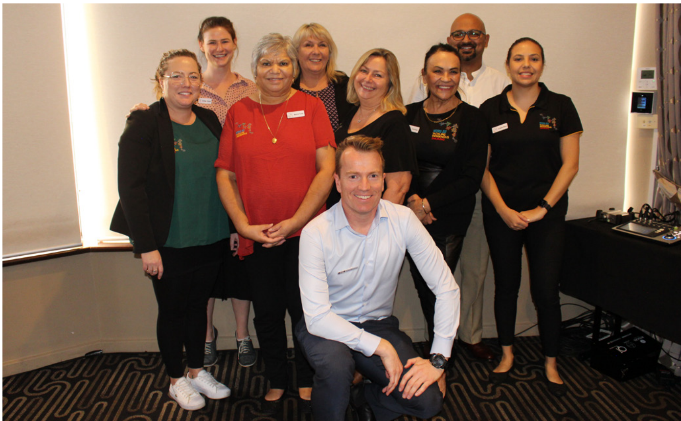
Some of the members of the National Best Practice Unit Tackling Indigenous Smoking