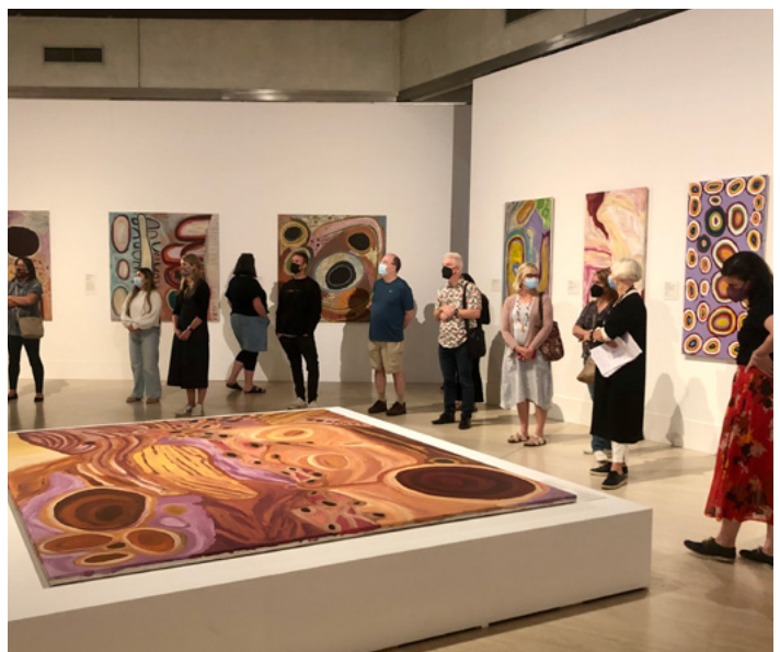
Staff cultural PD at the Art Gallery of WA