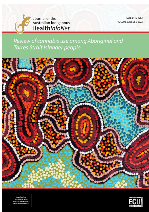
Review of cannabis use among Aboriginal and Torres Strait Islander people, including a summary, factsheet and video