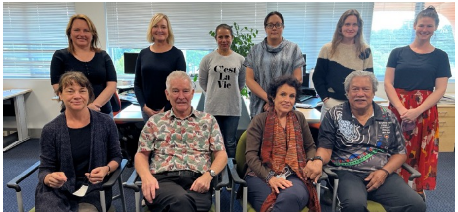
Uncle Mick paid a surprise visit and caught up with some of our staff