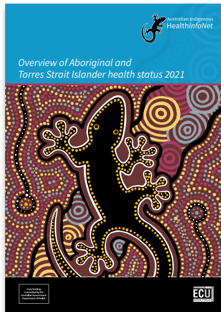
Overview of Aboriginal and Torres Strait Islander health status 2021