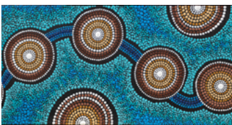
Artwork: When the fresh water meets the saltwater by Bec Morgan. This artwork is/was featured on the following page: