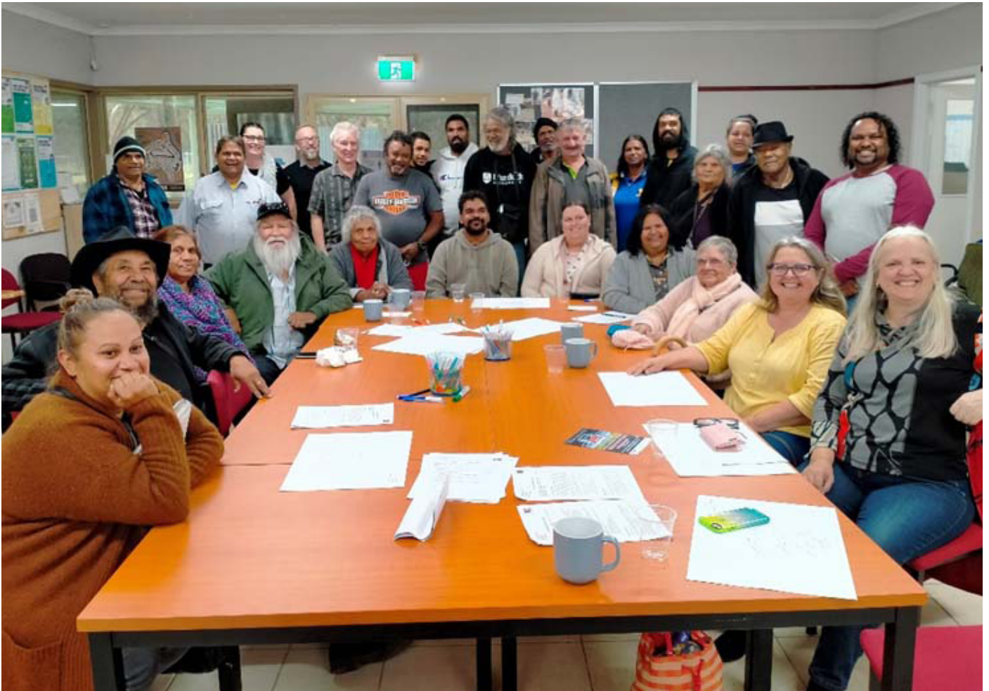
The consultation team with participants at the Mandurah workshop held at the Winjan Aboriginal Corporation facility in August.

I am delighted that an ECU research project funded by the Western Australian government has been consulting with natural helpers in Aboriginal communities in the south west and Perth urban areas of Western Australia.