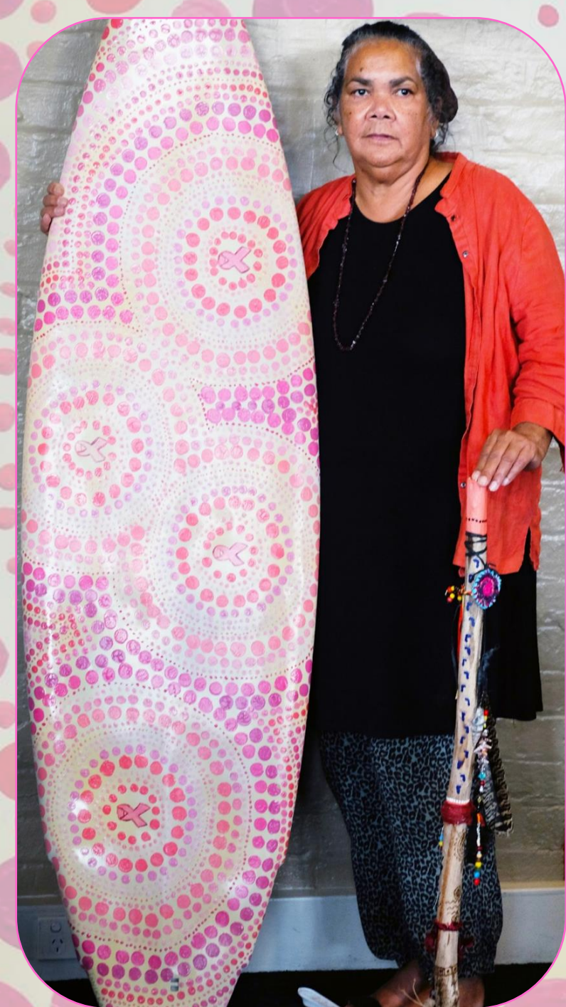
Learning through storytelling

Cancer is a story that is better shared. By connecting through a Yarning Circle, women bond and reach out – and in doing so they take back some control in their relationships, help strengthen their community and their family’s resilience, raise awareness of the importance of being cancer aware, early detection and screening, how to connect with health services, and overcome some of their personal fears and not be defined by cancer.