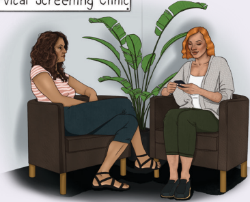
Cervical Screening Clinic

Depending on test results, some women may need to return earlier.