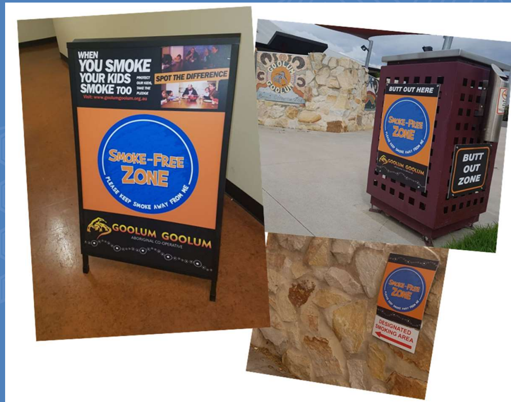
Smoke free signage