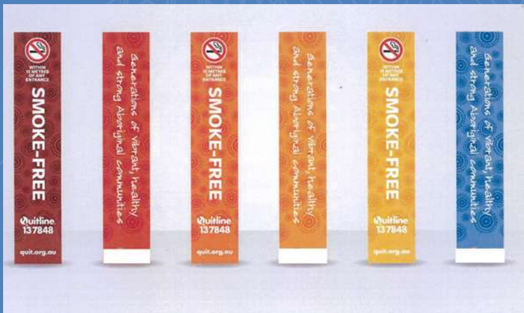
Bollards with Quit smoking messages

Estimated reach more than 2,000 people each day.