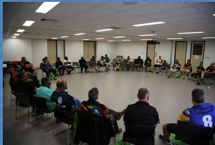
Men's Health Day