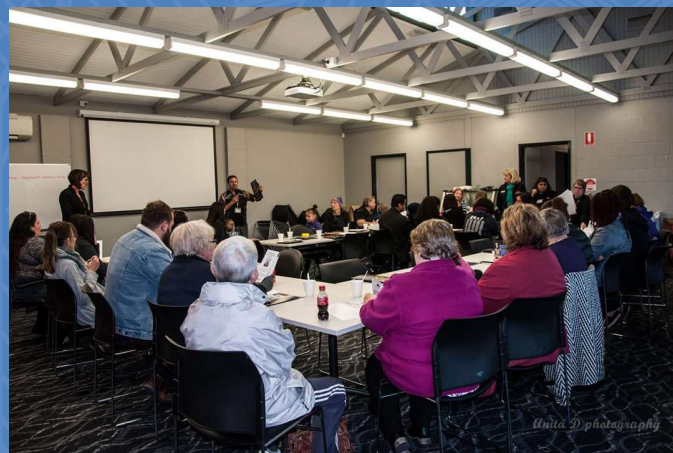
Community Health Care Dinner