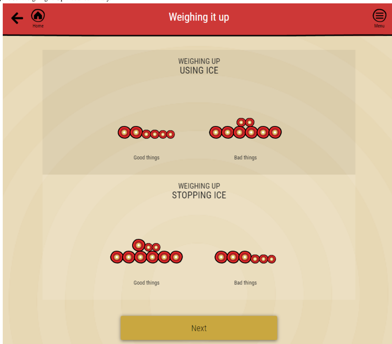
Figure 3. Weighing It Up visual summary.