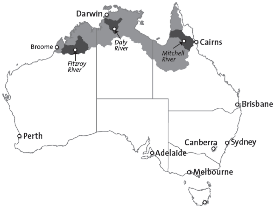
Figure 1. Map of TRaCK region (light grey) showing focal catchment areas (dark grey).

Indigenous resource management practices draw “mostly on long-standing customary knowledge and skills” (Altman & Whitehead, 2003, p. 3) and are inspired by obligations to care for country (Jackson & Palmer, 2014). Practices include living on customary estates (on country) at small settlements referred to as “outstations” and utilising the landscape to exploit resources, hunting and gathering, conducting ceremony and ritual, fire management, and obtaining and distributing resources according to local rules. Some management activities may be unrecognised by the formal resource management sector and Indigenous communities face significant and entrenched impediments to having their knowledge accepted by management and scientific institutions and the wider society (see Howitt et al. 2013; Jackson & Barber, 2013; Muller, 2014; Palmer, 2007). Multiple methodological and epistemological barriers to integrating Indigenous knowledge are evident in the region in which our study is located and as a result, a general scepticism towards research can be found in some sectors of the Indigenous community.