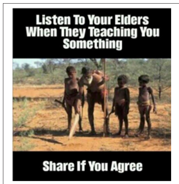
Figure 5. Facebook post relating to respect for Elders.

In remote contexts, cultural lore was occasionally related to health outcomes too. One Yarning Session participant, for instance, mentioned: