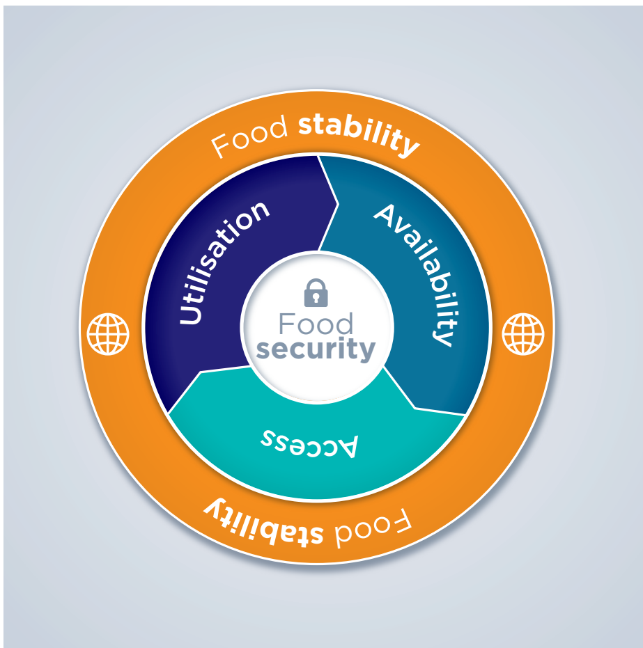
Figure 1: The four dimensions of food security

The Food and Agriculture Organization of the United Nations (2006) and the World Health Organization (2011) describe food security as having four dimensions, as shown in Figure 1.