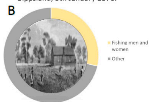
Figure 2. Reconstructed time budget for cultural fishing practices at two Stations 1875–1876. (A) By 1875 in Victoria male Aboriginals at Framlingham Station were permitted to fish only during Summer evenings. The pie diagram represents 24 h and in yellow the hours males were permitted to fish each day during summer; (B) In 1876 at Church Mission Station both men and women were only permitted to fish two days per week. The pie diagram represents seven days and in yellow the two days permitted for fishing. Original Figure developed from information at Victoria (1876). (Any images used in development of this figure were freely available via open access Creative Commons).

Church, Mission Station, Lake Tyera, Gippsland, 5th January 1876.