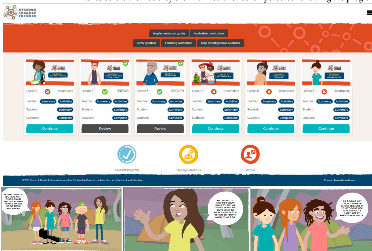
Figure 2. Program logo, example scenes and online platform design for Strong & Deadly Futures .

The logo and web design (Figure 2) were illustrated by Jenna Lee (a Larrakia, Wardaman and Karajarri artist from Gilimbaa ). The logo represents a complex individual surrounded by educational and social support, with multiple possible strong and deadly futures before them as they are informed and feel empowered following the program.