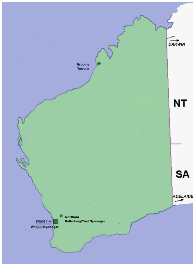
Figure 3 Map of Western Australia with current sites.

(such as those currently receiving treatment from the sites). It is vital that headspace co-researchers come from all levels of the organisation including executives, clinical, allied and administrative staff (approximately 3–5 from each partner service site). Although confidentiality will be maintained, co-researchers, due to their high-profile role in the co-design process, will be identifiable to other co-researchers and community members. Comprehensive culturally relevant information sheets in plain language are provided to ensure informed consent for all aspects of involvement in the research.