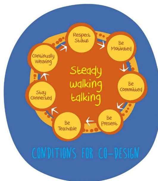
Figure 1 Steady Walking Talking co-design framework.

This research addresses the lack of cultural security (which affects the accessibility and responsiveness of youth mental health services) and culturally appropriate evaluation tools to determine the effectiveness of services in meeting the needs of Aboriginal young people. The intended outputs and outcomes will occur through a culturally grounded, relationship-based process that will create and sustain partnerships with Aboriginal Elders, young people and youth mental health service staff. Participants will work together to co-design appropriate service models, system change interventions and evaluation tools to measure organisational change. Unique to this project is the drawing together of cultural protocols and research to develop innovative, decolonised service provision to improve the social and emotional well-being of Aboriginal youth. (the term 'Aboriginal' has been used in this article to refer to both the Aboriginal and Torres Strait Islander peoples of Australia. Our intention in using 'Aboriginal' is to acknowledge the significance of place and that this project will be conducted on Aboriginal country in Western Australia with different clan groups. The authors acknowledge that Aboriginal and Torres Strait Islander peoples may