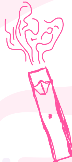
Vape or e-cigarette

Use of e-cigarettes during pregnancy is not advised, as the nicotine levels may be as high as conventional cigarettes . Even if they contain no nicotine, e-cigarettes contain other toxic chemicals, which could potentially harm the baby (see fact sheet 'Vaping').