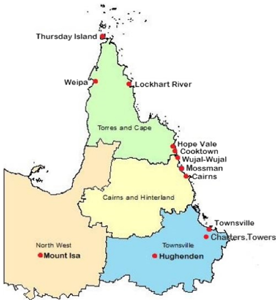
FIGURE 1 Map of research focus areas in North Queensland

numbers, a full assessment is not available. Cardihab ® is a commercial CR smartphone App that has been demonstrated to be effective, 21 but no information is published on access by people in R&R areas.