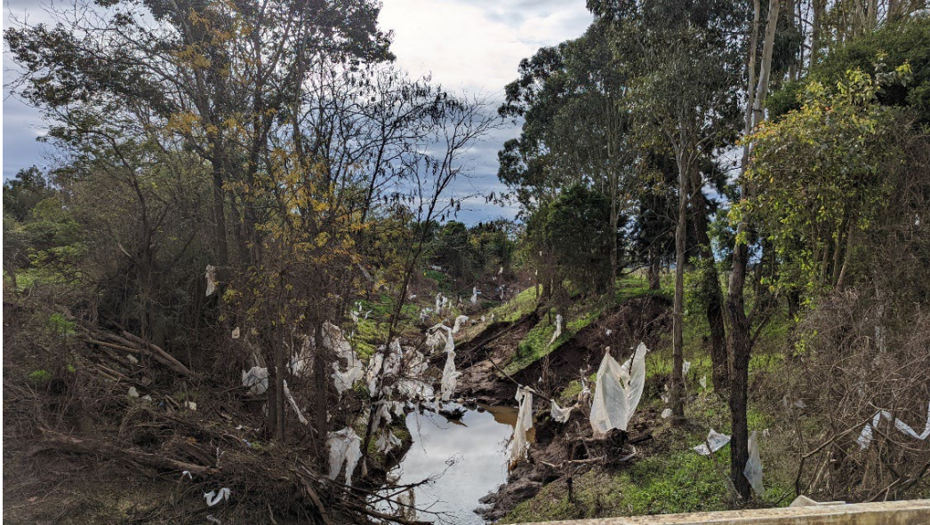
taken during site visit to Pitt Town Bottoms, 3 June 2022