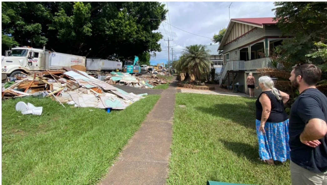
Figure 10 Stripped house interiors and other debris on nature strip during clean-up after the floods

Submission 29, Danielle Pickford and Sarah Moran, p 14