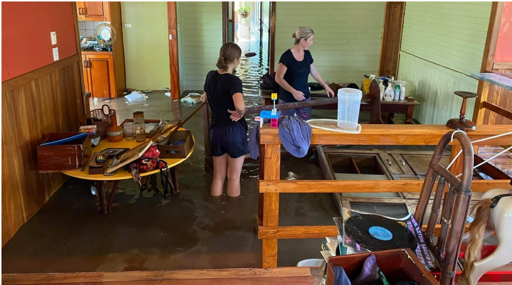
Figure 9 People inspecting inundation of floodwater inside a dwelling

Submission 29, Danielle Pickford and Sarah Moran, p 15