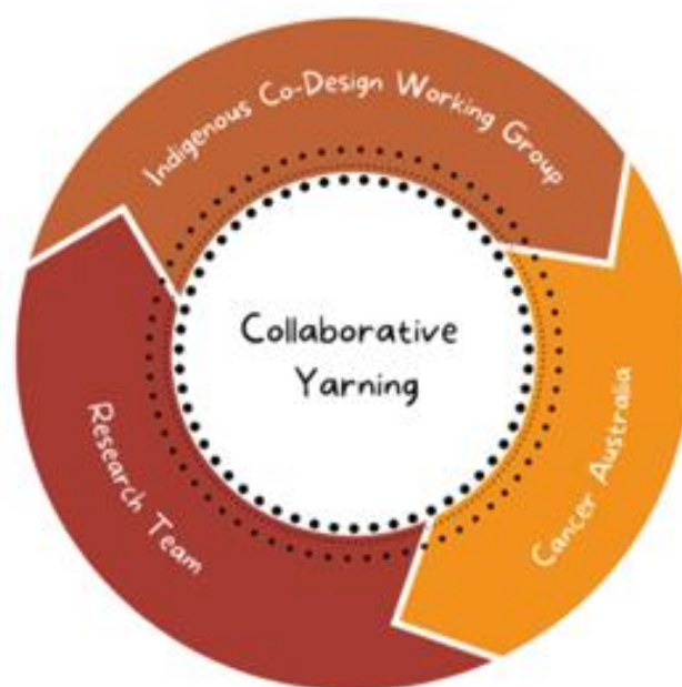
Figure 2. Collaborative Yarning Methodology.

Document information, including author/s, year of publication, document (grey only) or study (peer-reviewed only) type, and topic focus (including specific health focus or health more broadly), were extracted by two First Nations Australian research assistants, then checked by AG, KN and KA for accuracy. Optimal approaches to co-design with First Nations Australians were extracted using NVivo 12 [14] software using the three stages of thematic development recommended by Thomas and Harden for thematic synthesis of qualitative research [15] by TB, AG and KA. The data were coded ‘line-by-line’ and then developed into ‘descriptive themes’. Draft results of the thematic analysis were emailed to the FNCDWG to gain feedback, then TB, AG and KA met to agree on the incorporation of all the FNCDWG feedback into the results.