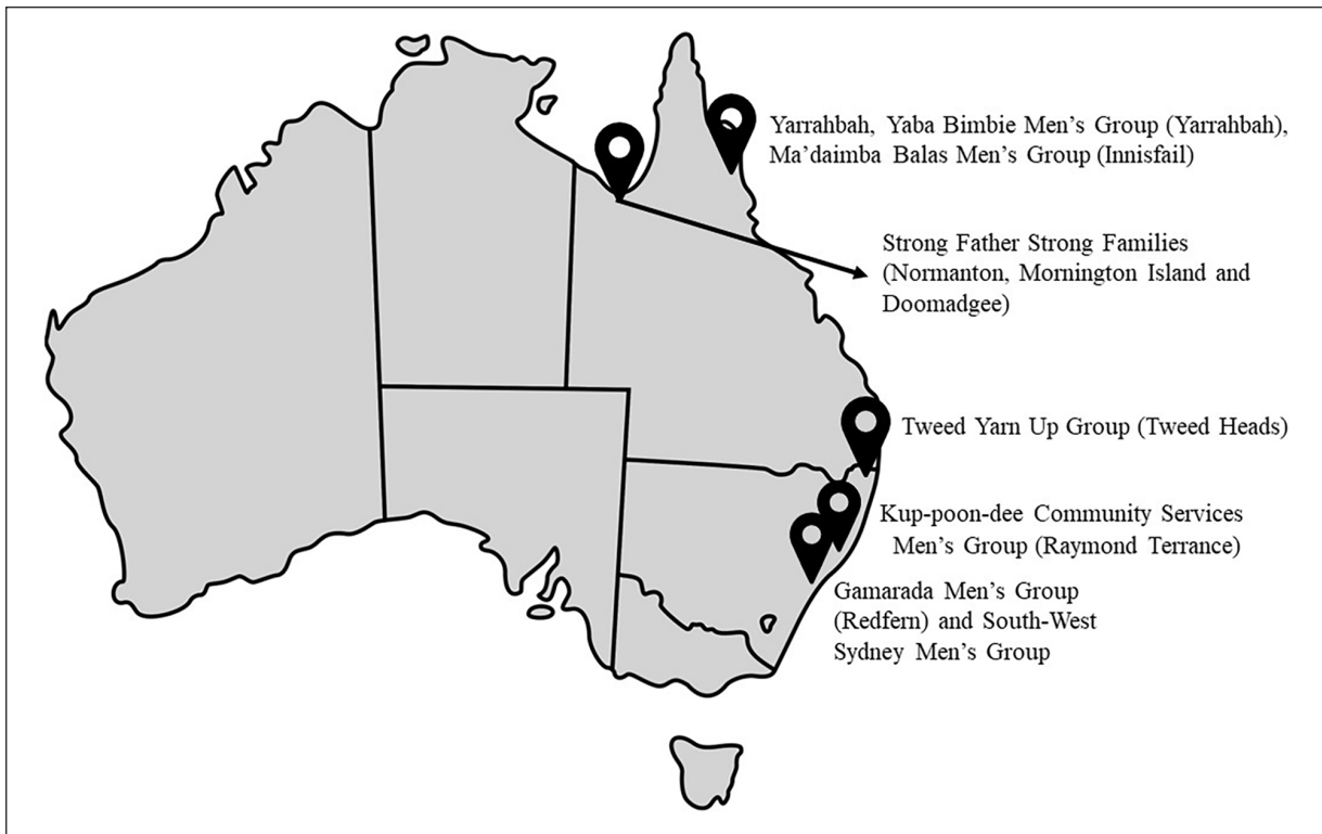
Figure 2. Mapped location of men's groups (Adapted from Australia map, states simple, Lokal_Profil, 2007, Wikimedia Commons, https://en.wikipedia.org/wiki/File:Australia_states_blank.svg ).