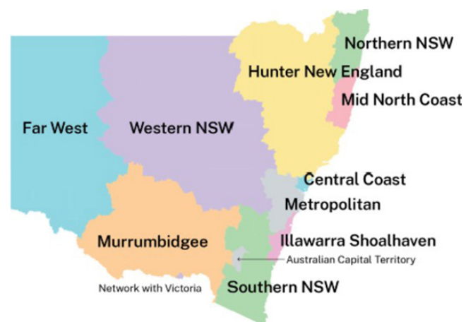
Figure 1: Map of NSW showing the health districts with Hunter New England Local Health District in yellow.

Primary participants were Aboriginal and Torres Strait Islander people aged 18 years and over who had received