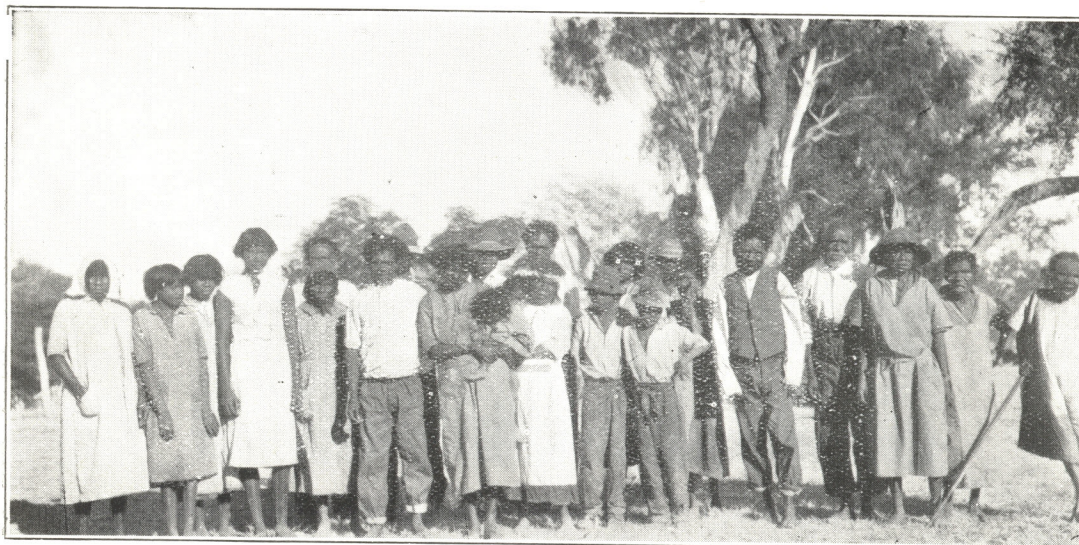
Photograph "D"—Natives at Violet Valley Station.