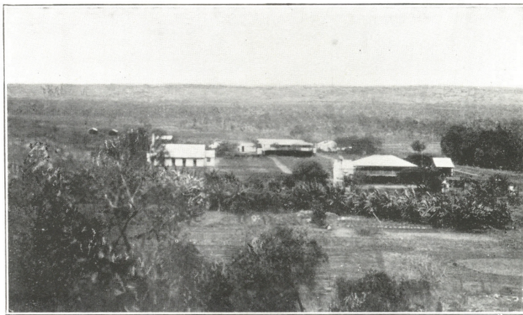
Photograph "G"—Kunmunya Mission, Port George IV.