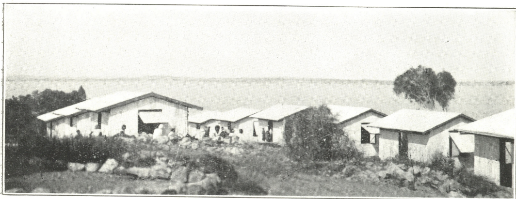
Photograph "B"—Darwin Leprosarium.