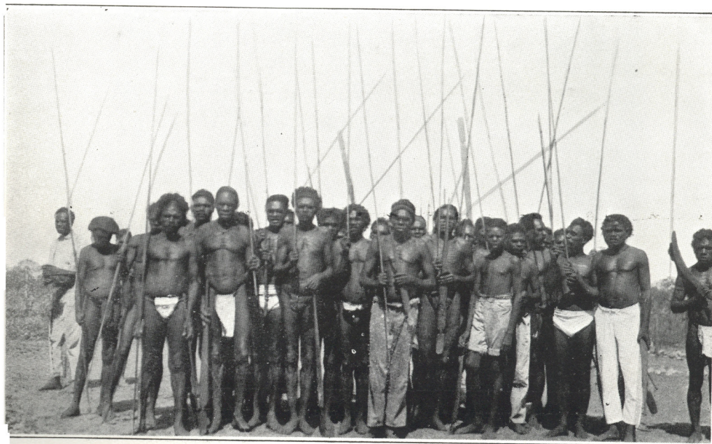
Photograph "F"—Drysdale River Mission Natives.