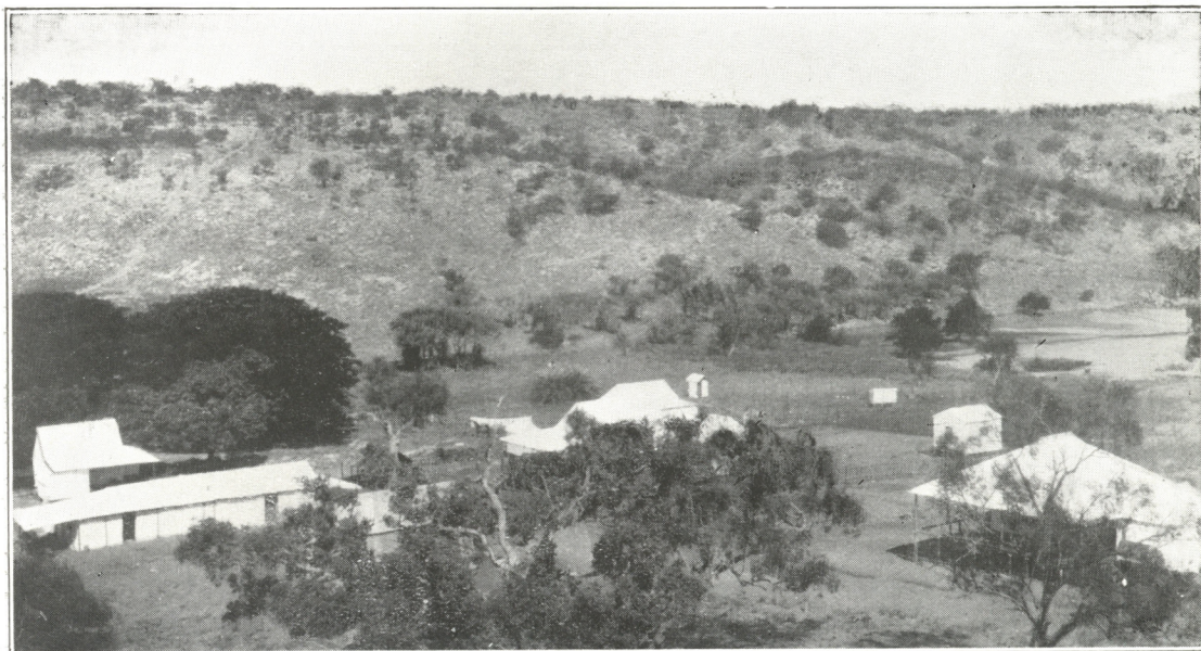
Photograph "H"—Sunday Island Mission.