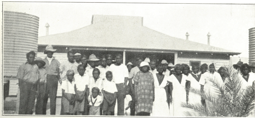
Photograph "C"—West Australian Patients at Darwin Leprosarium.