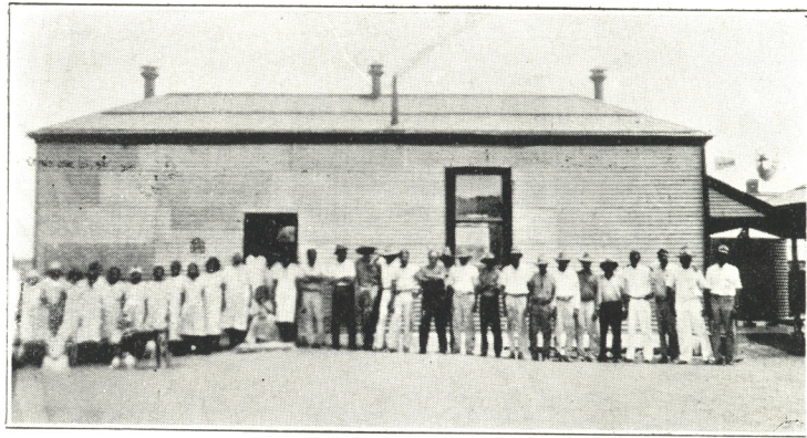
Photograph "A"—Native Hospital, Port Hedland.