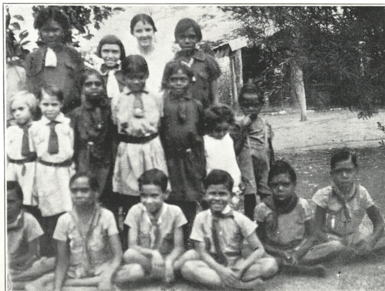
Photograph "I"—Teacher and Children at Kunmunya Mission School.